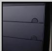
2 x CD/DVD Bezel