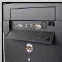
USB 2.0 & Audio